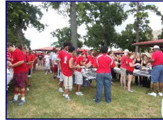
2010 Feed the Band