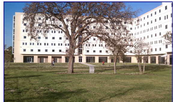
The Monument as it appears today outside Cougar Village